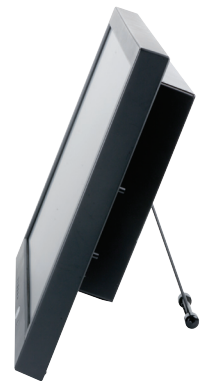
Unique picture frame desktop stand

Delivering such features as 3D Digital Comb Filter, DVI Input, USB Hub, PIP, and a whole range of elements to enhance any application, Pelco's LCD Displays are your crystal clear choice.